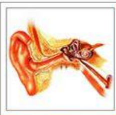
Miasmatic Study of Ear