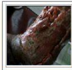
Case of Gangrene

Repertory Anticipation Organon Genetics Deciding on Similimum